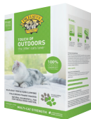
Touch of Outdoors™