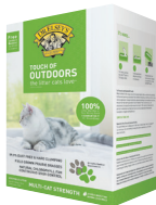
Touch of Outdoors™