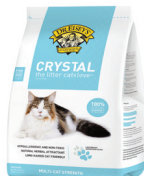
Crystal (formerly Long Haired)